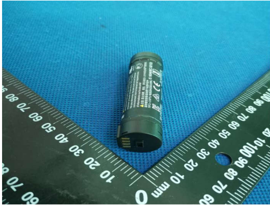
电池组外观 1 View of the battery 1