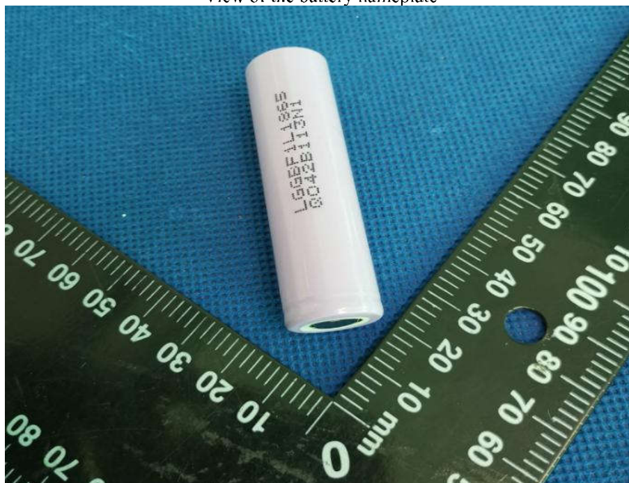
元件电池 View of the component cell