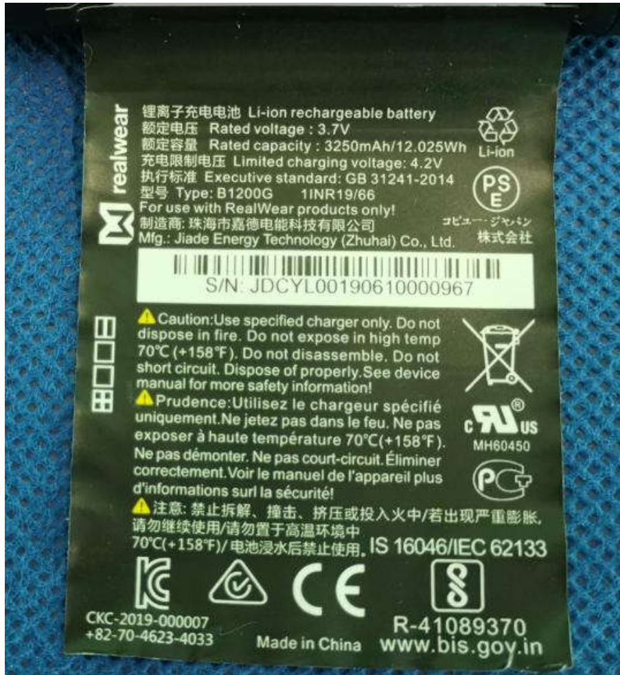
电池组铭牌 View of the battery nameplate